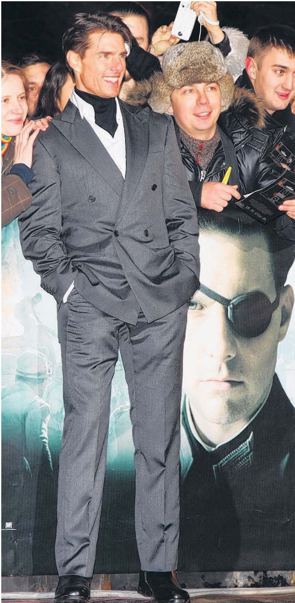
Actor Tom Cruise.