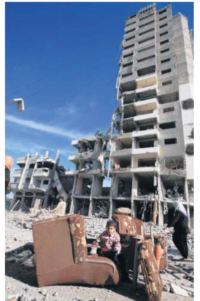
Hard live: A boy in Palestina.

So they did not want to stop that war. Suddenly the Jewish people also fired rockets to the other side. That's why the war started. More than twenty days ago. Every day and every night so many people die because of the bombs. The Israelis are so strong that the Palestinians can't do anything. The country is full of blood and corpses.